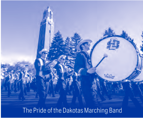
The Pride of the Dakotas Marching Band

"Hey Jackrabbits, welcome to South Dakota State University! Getting involved is the best (and most fun) way to catalyze your success at SDSU. Whether that be intramural sports, chess club, or student government, you can count on making great memories with fellow students and staff. Our amazing 200+ student-led organizations are the fuel to our fun at SDSU and know that you will find the one that is just right for you! While we wish you could say forever, your time at SDSU is limited, so make the best of it! I challenge you to ask questions, meet new people, and try new things, but most importantly, live in the moment. We are proud to welcome you home, and so excited for you to start your journey as a jackrabbit. Best of luck!"