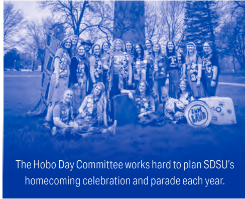
The Hobo Day Committee works hard to plan SDSU's homecoming celebration and parade each year.