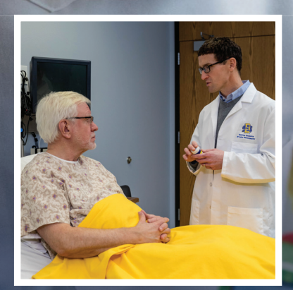
Medication Therapy Management