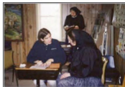
Colony Visit for SDRBHS

Collection of Pediatric Reference Database for Bone Ultrasound-North America in collaboration with Sunlight Medical Ltd.: The purpose of the study is to establish reference values using quantitative ultrasound for bone measurements (speed of sound) by age in North American pediatric population for the Sunlight Omnisense™ 7000P for two skeletal sites; i.e. 1/3 distal radius and mid-shaft tibia.