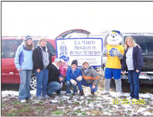
SDSU Hobo Days 2005

Effects of Protein Supplementation on IGF-I, IGF Binding Proteins, and Markers of Bone Turnover in 18 to 25 Year Olds in collaboration with Dr. Matt Vukovich in the Applied Physiology Laboratory at South Dakota State University. The purposes of the study are to assess the effect of protein supplementation during physical activity on increases serum IGF-I concentrations and to determine if a daily protein supplement will change markers of bone formation and resorption, which favor an increase in BMD.