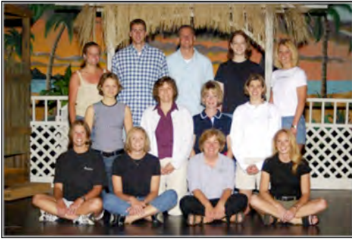
EAM Staff & Students ~ 2000