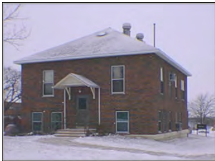
Ethel Austin Martin Building

The E.A. Martin Nutrition Committee assists the Chair in the general plans and activities for implementing the different phases of the Human Nutrition Program and acts as an advisory group to the Chair. The committee recommends to the Chair and Vice President for Academic Affairs interdisciplinary credit courses for consideration and other educational experiences offered by the program. The committee also assists in planning the annual E.A. Martin Distinguished Lectureship program and engages in other duties related to the E.A. Martin Human Nutrition Program as requested by the Vice President for Academic Affairs, Vice President for Research, or the President. Members include faculty from numerous colleges (Colleges of Family & Consumer Sciences, Education & Counseling, Agriculture & Biological Sciences, Nursing, and Pharmacy).