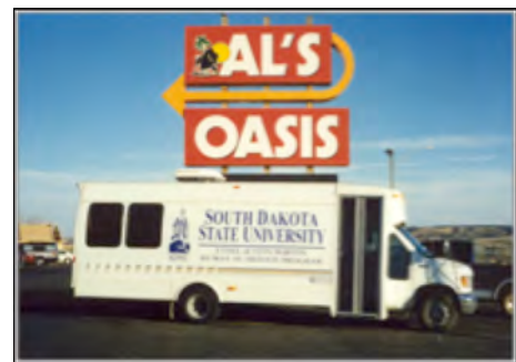
The Bone Bus likes to stop at those fun places.