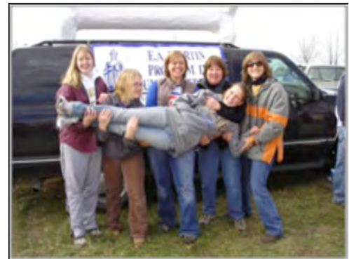
Hobo Days ~ 2006