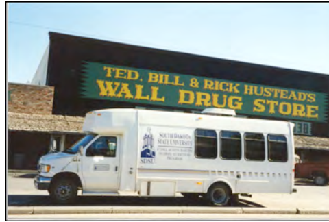
You can go anywhere from here!

The E.A. Martin Program has a mobile research unit that moved the laboratory to the field. On board, state-of-the-art imaging equipment can be used for bone measurements and body composition analyses. This equipment includes a dual energy x-ray absorptiometer (DXA, Hologic Discovery/Apex) and two peripheral quantitative computed tomography for both arm and leg use (pQCT XCT 2000 & XCT 3000, Norland/Stratec).