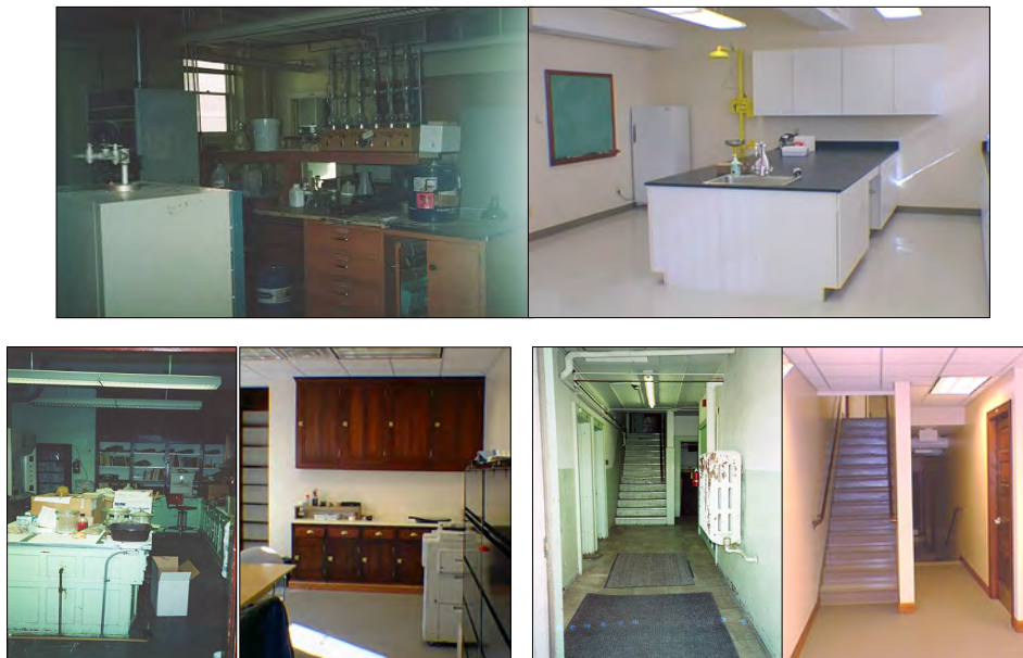
1999 Renovation of the former Biology Annex. Before and after pictures of lab space (top), workroom (left bottom), and north entrance lobby (right bottom) of EAM Building.

In 1999 extensive renovation of the former Biology Annex building located near Agriculture Hall and Dairy/Microbiology was completed. This building, renamed the Ethel Austin Martin Building, is one of the locations of the E.A. Martin Program and provides 3500 square feet of offices, laboratories and a conference room. In early 2008, the EAM Program expanded to the 3 rd floor of Wecota Hall adding 16 offices, a conference room, and a general workroom.