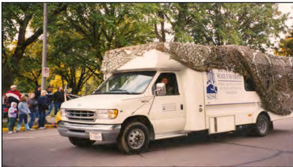
EAM "Bone Bus" as an entry in the Hobo Day parade