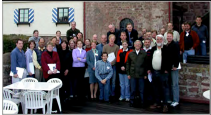
Black Forest Forum for Musculoskeletal Interactions ~ 2005

Binkley: pQCT Findings in Children with Cystic Fibrosis and Cerebral Palsy vs. Control Children. Presented at the 2nd Black Forest Forum for Musculoskeletal Interactions, Bad Liebenzell, Germany, May, 2005.